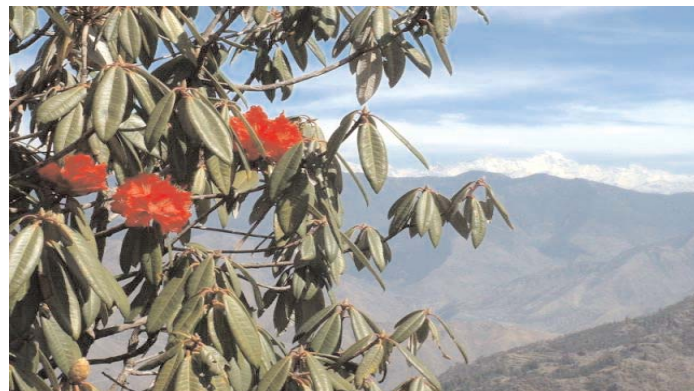
the beginning of Spring in the Himalayas

Red blossoms on rhododendron trees announce