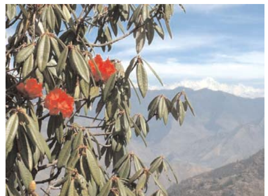
the beginning of Spring in the Himalayas

Red blossoms on rhododendron trees announce